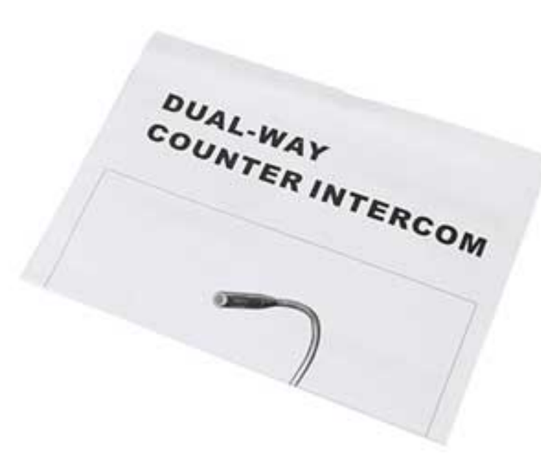
English user manual