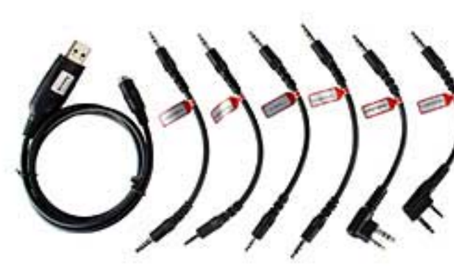
6 in 1 programming cable kit