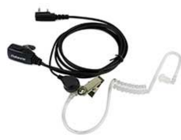
Acoustic Tube headset