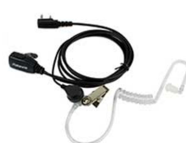
Acoustic Tube headset