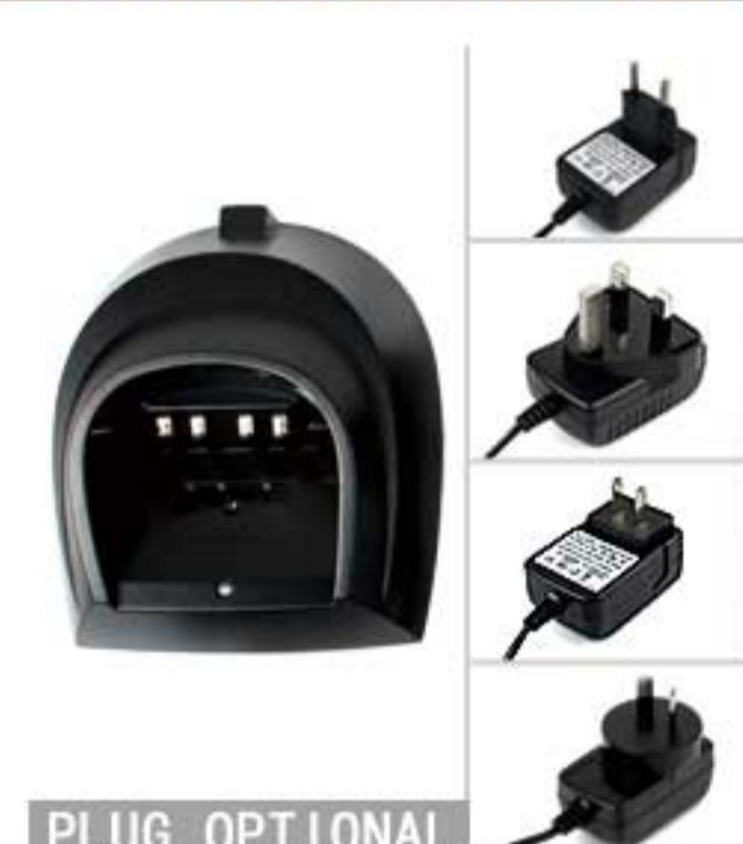
PLUG OPTIONAL Charger