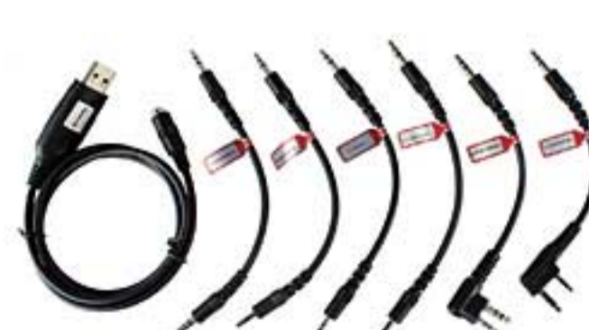
6 in 1 programming cable kit